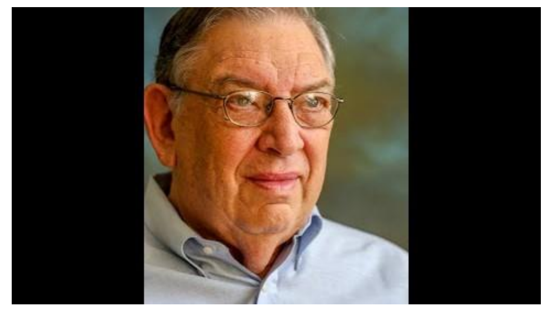
https://www.youtube.com/watch?v=Sz3wrw6wV2s Clip starting at 4:15 and 13:48